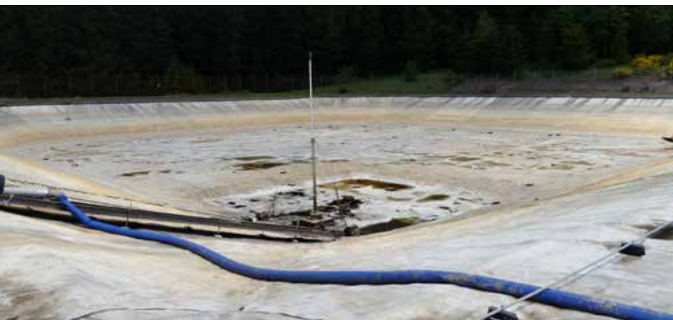
FIGURE 4 April 2018 northern half of pond after cleaning