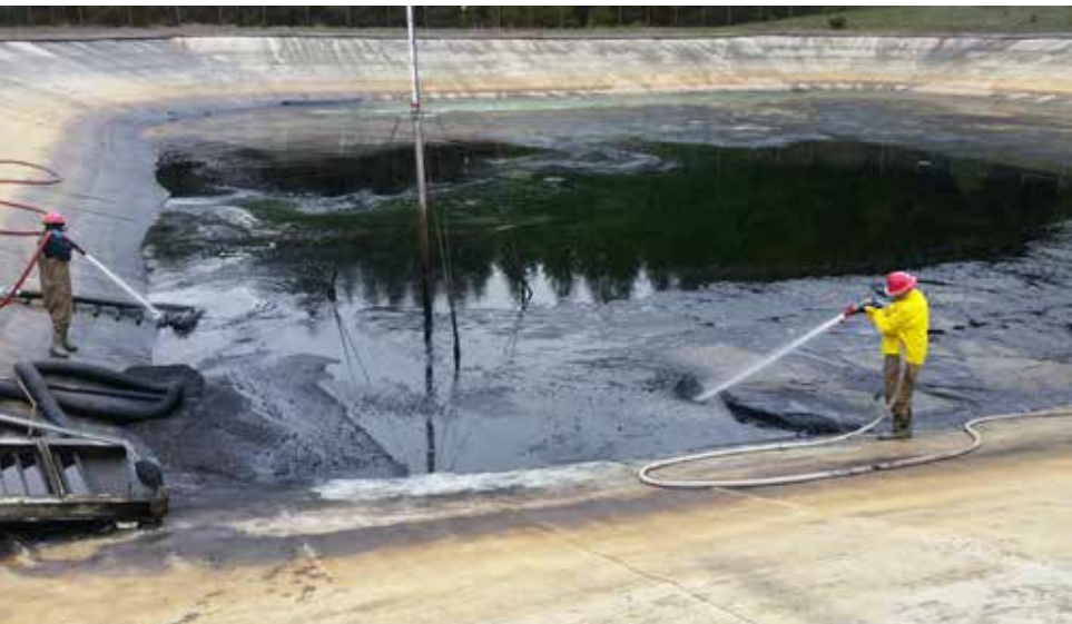
FIGURE 3 April 2018 cleaning sludge from northern half of pond