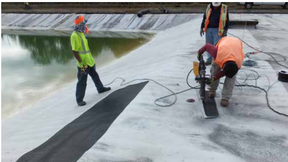
FIGURE 2 Patching a hole in pond liner where sample was taken for testing in May 2014. The photograph shows trial weld being performed where new HDPE is being welded to old pond liner.

Visual inspection of the exposed and cleaned geomembrane in both halves of the pond indicated the geomembrane to be in good condition with no signs of degradation or cracks. While no repair welds were required in 2018, the repair welds performed in 2014 appeared to be successful with excellent trial-weld field test observations. Figure 2 shows a patch being installed on the sampling location, Figure 3 shows the beginning of removing sludge from the northern half of the pond in 2018, and Figure 4 shows the empty northern pond after cleaning.