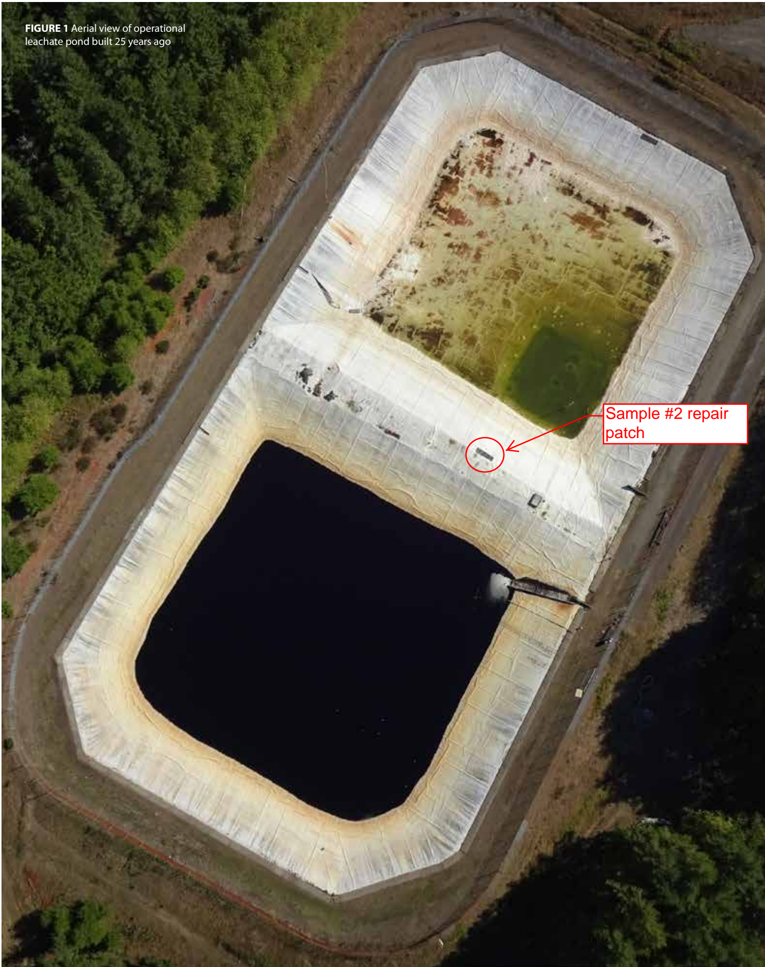
FIGURE 1 Aerial view of operational leachate pond built 25 years ago